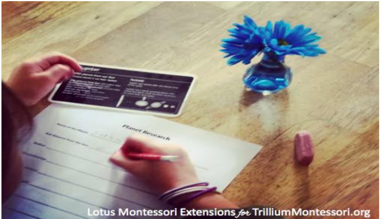
Books about space

Lotus Montessori Extensions for TrilliumMontessori.org