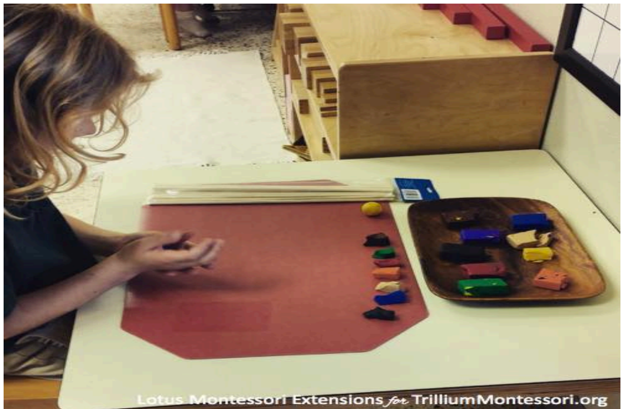
Make the solar system with clay