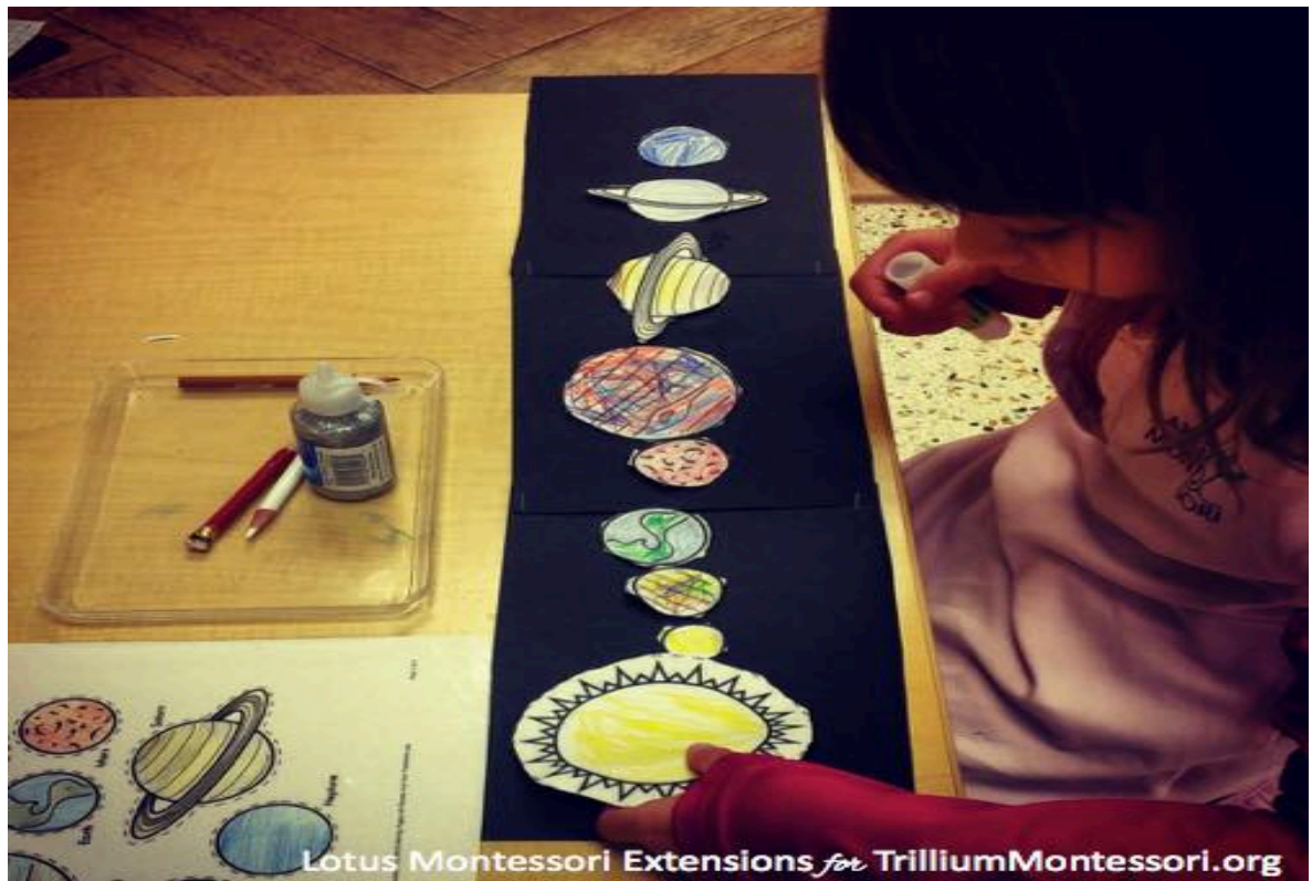
A simpler version of gluing the planets in order