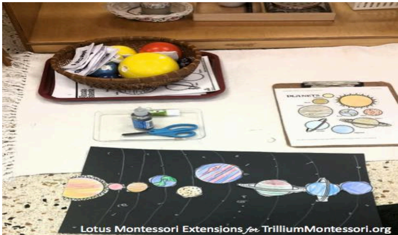
Color cut and glue the planets in order, and draw the orbit lines