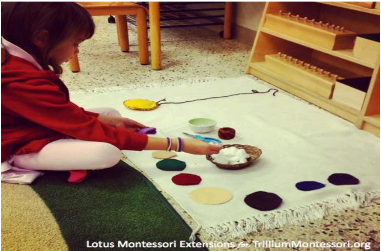
Solar system sewing work