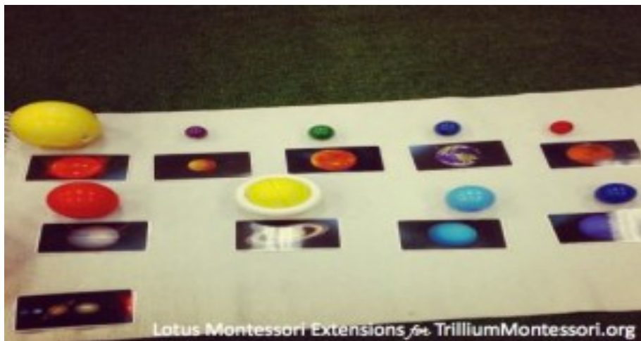
Object Picture making

One of the favorite lessons to give is the "Exploration of the Planets." Children learn the names of the planets and explore them in a variety of hands on ways.