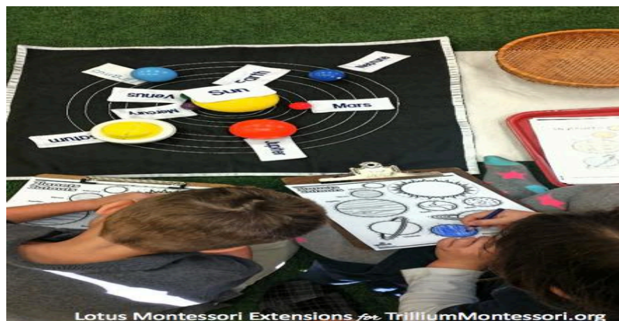
Using the Planet Mat to learn the order of the planets